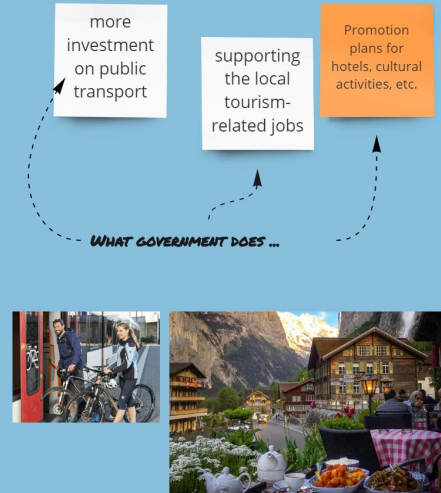
Figure 3. The presentation of Scenario 1 on the MIRO virtual whiteboard

Today is Saturday August 10, 2020 and I'm so excited to re-visit Lauterbrunnen in Bern canton with my friends after a long time. It's my first weekend travel outside my canton "Fribourg" after COVID-19 crisis. We planned to take the train from Fribourg city to Thun and then cycle from there to Lauterbrunnen. There's a new-built cable car in the area that brings tourists smoothly to a high platform, where one can look at beautiful Jungfrau. I found this idea really great as many tourists such as elderly people and kids might not be able to hike. I could never travel at this price before April 2020, because the public transport, cable car, hotels and museum offer special prices since the end of Corona lockdown. For lunch we planned to eat Röschti in a local restaurant and of course, we will buy some cheese from a small shop near our hotel.