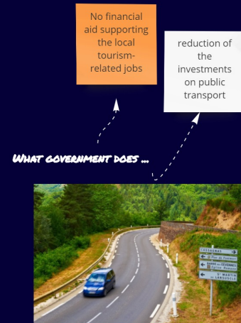
Figure 6. The presentation of Scenario 4 on the Miro virtual whiteboard

Today is 15th of August 2020 and my family and I are going to travel to south of France by our car. It's almost 600 km from Fribourg to Marseille and takes around 6 hours to get there. There is a very nice resort along the sea, where we can rest and chill for one week. Unfortunately, many of lakeside infrastructures have abandoned in Switzerland and the hotel owners couldn't survive due to the drastic fall in tourism rate. Many of local shops just closed because no one except locals was there to purchase from them. However, travelling restriction regulations are completely eliminated and borders are open again which means it's a perfect time to travel abroad after a long lockdown. Despite many seats are empty in trains, I personally prefer to travel by my own car and enjoy the natural beauties of the roads. Besides, it costs less for four of us to travel by car, I think.