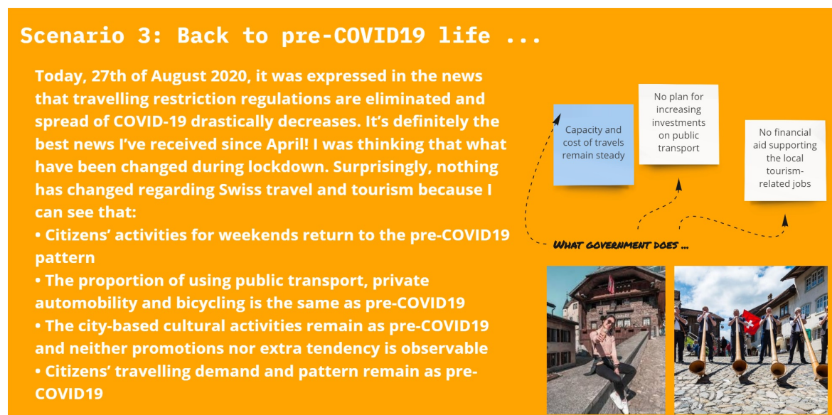
Figure 5. The presentation of Scenario 3 on the MIRO virtual whiteboard